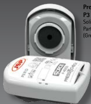
PressToCheck™ P3 (F-4003) Solid + Liquid Particles (Greater Capacity)