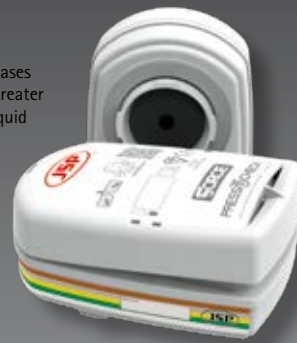
PressToCheck™ ABEK1P3 (F-4713) Organic / Inorganic/Acidic Ammonia Vapours and Gases plus Solid and Liquid Particulates