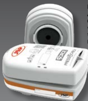
PressToCheck™ A2P3 (F-4123) Organic Vapours + Gases with boiling points greater than 65°C Solid + Liquid Particles